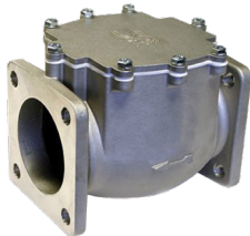
3" Aluminum Swing Check Valves