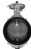
Butterfly Valves - Resilient Seated