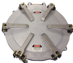
Dry Bulk Manholes